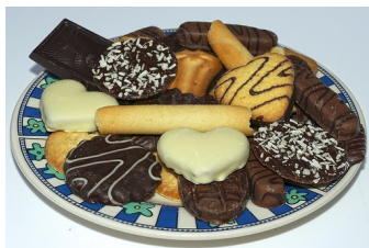
10. Eating foods high in sugar