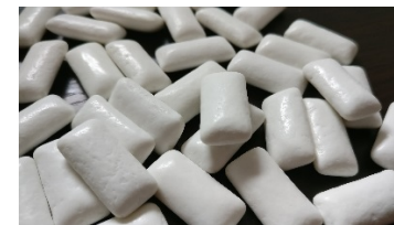
12. Chewing gum