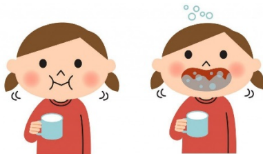
11. Rinsing straightaway after brushing