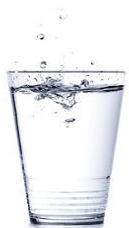
13. Drinking water